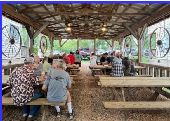
Waiting for dinner to be served.