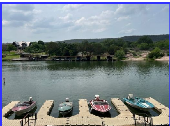
If you wonder why we like the Heart of Texas Lake Resort, check out the docks and the view.