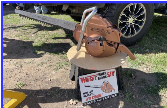
When have you ever seen a Wright Power Blade Saw at an outboard meet?