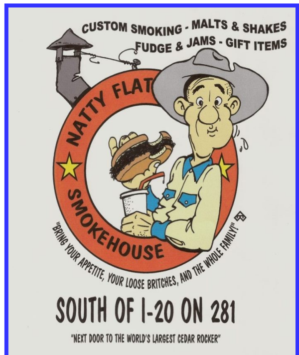
An advertisement for some great barbecue.