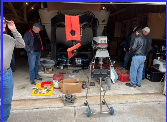
The top two photos above show many of the outboards that were for sale. The bottom photo shows the various parts for sale. Look behind the parts and you will see the bottom hull of the big houseboat that was still sitting in the garage.

Lunch was fantastic as you can imagine. You could have a hotdog on a bun with a topping of chili and cheese, or just mustard, whatever you